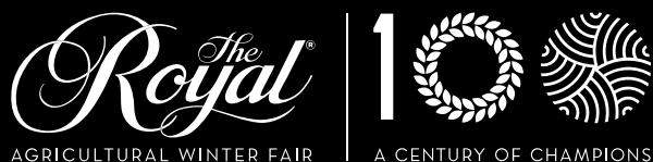
NOVEMBER 16, 1984